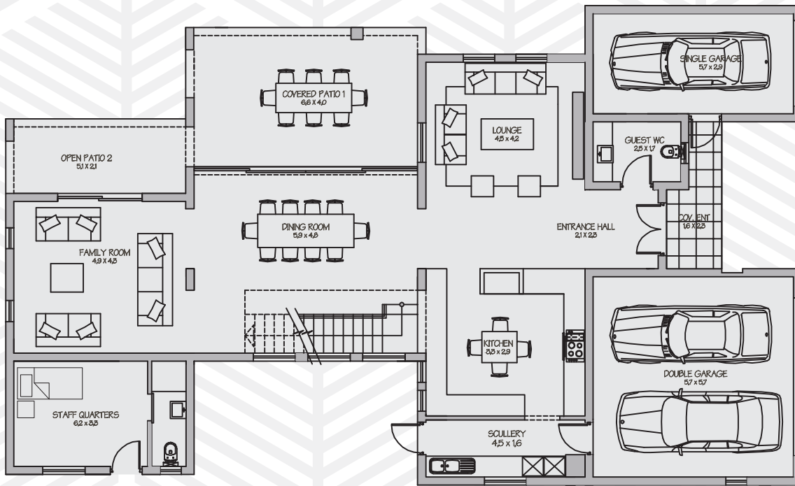
ground floor plan - not to scale