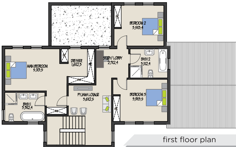
first floor plan